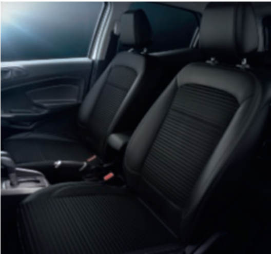
Groove fabric in Ebony seat facing, with Salerno leather in Ebony seat bolster (Standard on Titanium)