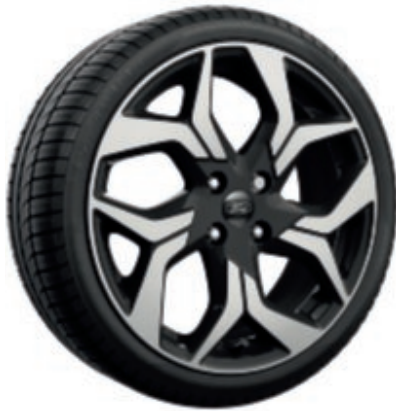
18" 5-spoke Black machined alloy wheel (Option on ST-Line)