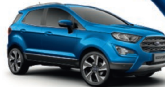
Blue Lightning Exclusive body colour*