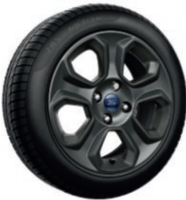
16" 5-spoke Magnetic painted alloy wheel (Standard on Zetec)