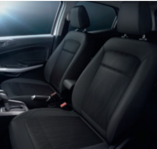
Dwell fabric in Ebony seat facing, with Belgrano in Ebony seat bolster (Standard on Zetec)