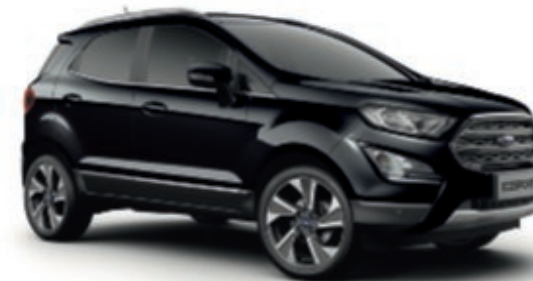
Agate Black Premium body colour*