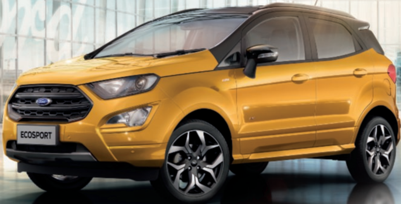
EcoSport ST-Line with contrasting roof in Agate Black, Luxe Yellow exclusive body colour and 18" Black machined alloy wheels (options at extra cost)