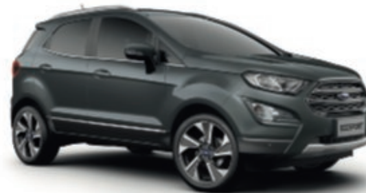
Magnetic Exclusive body colour*