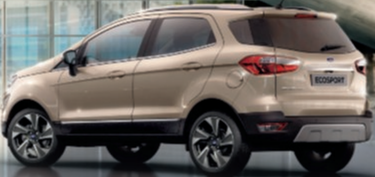
EcoSport Titanium with Silk exclusive body colour and 18" Flash Grey machined alloy wheels (options at extra cost)