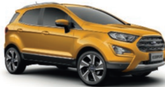
Luxe Yellow Exclusive body colour*

*At extra cost. The Ford EcoSport is covered by the Ford Perforation Warranty for 12 years from the date of first registration. Subject to terms and conditions. Note The car images used are to illustrate body colours only and may not reflect current specification or product availability in certain markets. Colours and trims reproduced within this brochure may vary from the actual colours, due to the limitations of the printing processes used.