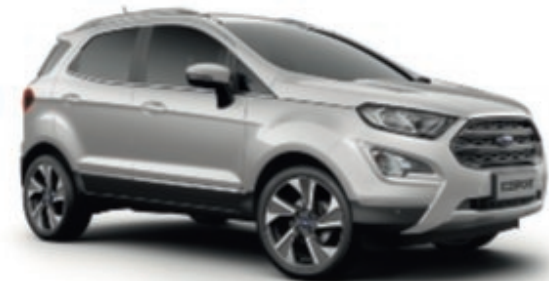
Moondust Silver Premium body colour*