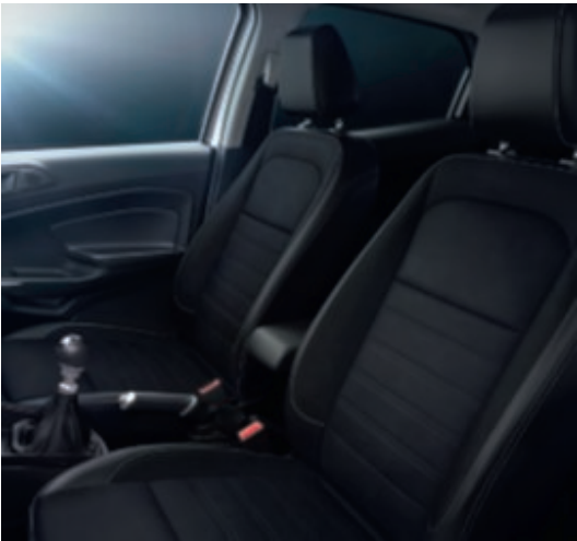
Miko Dinamica Fabric in Ebony seat facing, with Metal Grey stitching and Salerno leather seat bolster (Option on ST-Line)