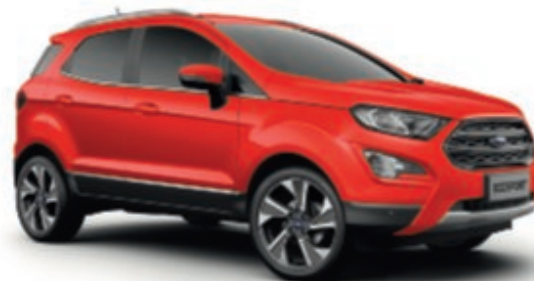
Race Red Standard body colour*