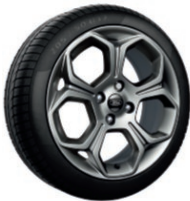
17" 5-spoke Dark Tarnish alloy wheel (Standard on ST-Line)