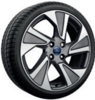
18" 5-spoke Flash Grey machined alloy wheel (Option on Titanium)