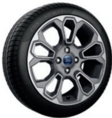
17" 10-spoke Flash Grey machined alloy wheel (Standard on Titanium)