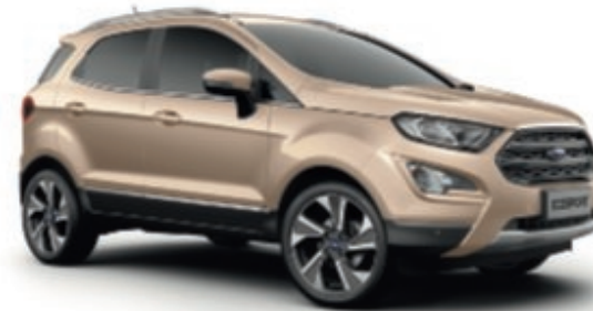
Silk Exclusive body colour*